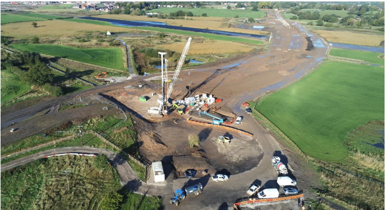
(fig 3. Current on site progress for PRR project)

Though neither of these risks currently impact the critical path, there is potential that these risks could escalate and become significant threats to the scheme completing on time.