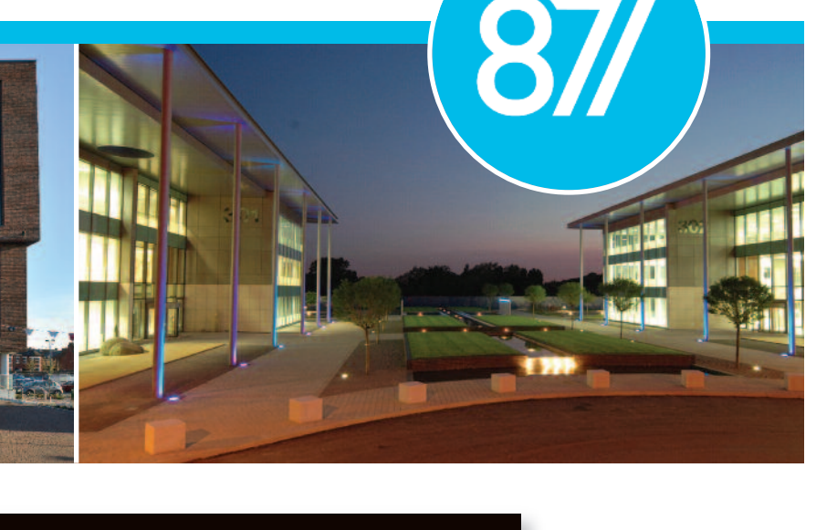
Chair, Cheshire and Warrington LEP

871candwep.co.uk STRATEGIC ECONOMIC PLAN CHESHIRE AND WARRINGTON MATTERS